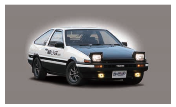
AE86 Sprinter Trueno 3-door hatchback exhibited in the Tokyo Auto Salon. The Trueno with a black-and-white color scheme, which was driven by the leading character is a well-known comic book is still popular briday.