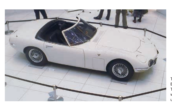
Toyota 2000GT Convertible appeared as a Bond car in the British move, "You Only Live Twice." The elegant convertible body style with beautiful wire spoke wheels was unmistakably distinctive.

The Toyota 2000GT was unique because it was developed jointly with Yamaha Motor Co., Ltd., which was achieving spectacular results in motorcycle racing at that time. The joint development project was carried out in a way that was never done before. Toyota established a branch office of its Product Planning Department inside Yamaha Motor. Toyota supplied main parts such as the engine, transmission and steering mechanism, and Yamaha Motor tuned the engine and produced and assembled parts. The development of the "86" is a further "dream collaboration" drawing on the strengths of the two companies after the Toyota 2000GT development project.