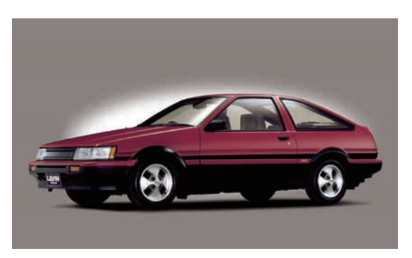
AE86 Corolla Levin 3-door hatchback. Also available was a 2-door coupe model.