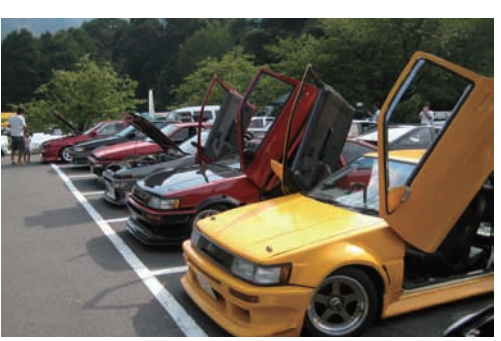
Fan meetings and track events draw crowds of loyal AE86 fans even today. There are many tuning shops specialized in the AE86