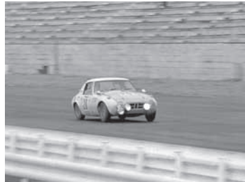
Toyota Sports 800 participated in the Fuji 24-Hour Endurance Race held in 1967. Leveraging on its excellent fuel efficiency, the Sports 800 competed head-to-head with