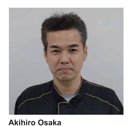
Chief Test Driver Senior Expert, GR Development Department,

Sasaki: "Ordinarily, you establish objectives for individual aspects of the vehicle's performance, such as driving stability, ride comfort, etc. But with the '86,' we really emphasized overall harmony. If one aspect of performance stood out from the rest, we worked to raise the others. If that went too far and exceeded our initial objective, then next time we would raise